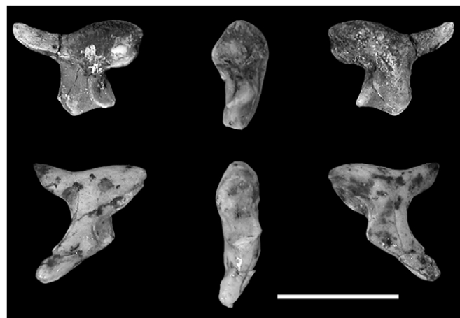
Fig. 3. The SK 848 ( Upper ) and SKW 18 ( Lower ) early hominin incudi in lateral ( Left ), anterior ( Center ), and medial ( Right ) views. (Scale bar: 5 mm.)

In contrast to the malleus and incus, stapes morphology is fairly similar across extant hominids ( SI Appendix, Fig. S3 ). Metric dimensions in all of the early hominin stapedes, including the size of the footplate, are relatively small compared with living humans ( SI Appendix, Table S6 ). The footplate area in SKW 18