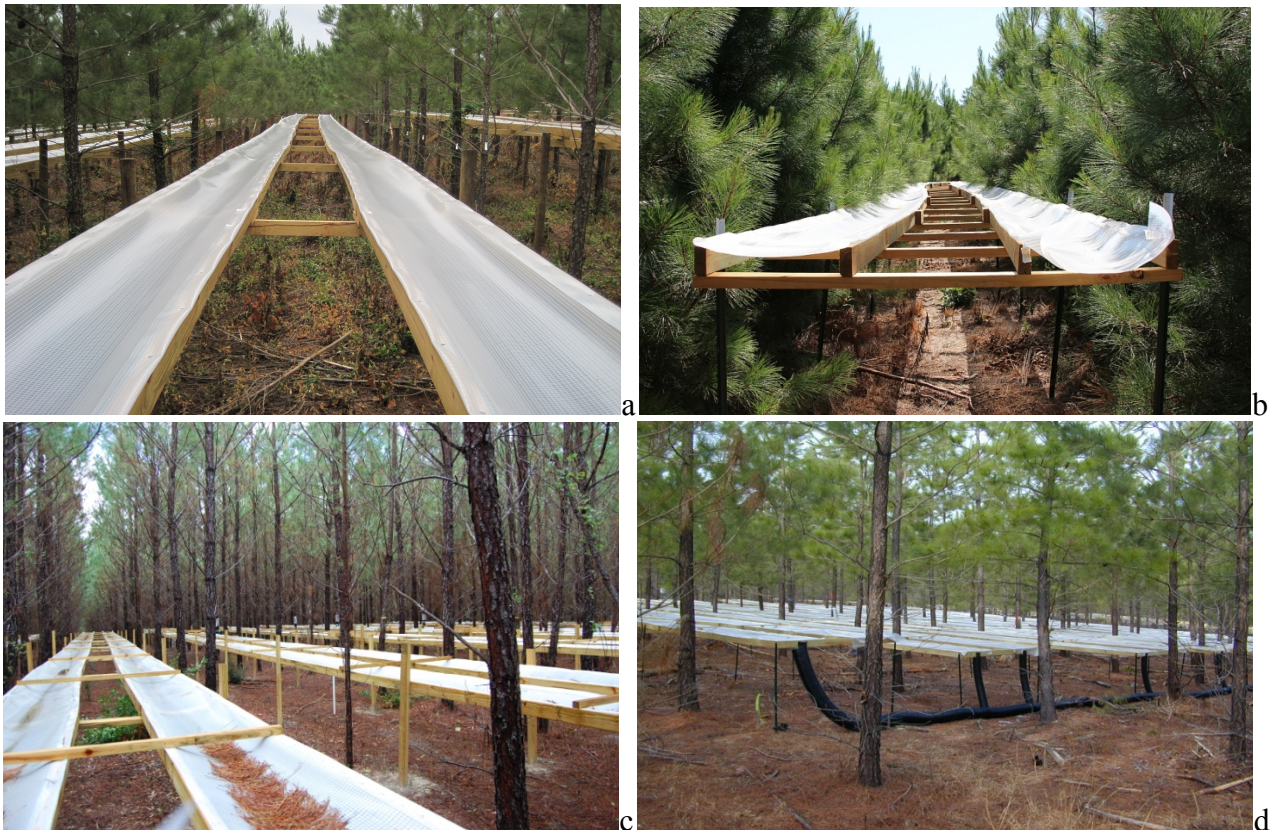
Figure 2. Recently installed (2012) throughfall excluders at the site in Taliaferro, Co., GA (a), McCurtain Co, OK, (b), Taylor Co., FL (c), and Buckingham Co., VA (d).

Nitrogen and phosphorus was applied as 432 \text{ kg}\cdot\text{ha}^{-1} urea and 140 \text{ kg}\cdot\text{ha}^{-1} diammonium phosphate. Agrotain Ultra (Koch Agronomic Services, LLC, Wichita, KS, USA) was included at a rate of 0.43 \text{ mL}\cdot\text{kg}^{-1} of urea to reduce nitrogen volatilization. In addition to nitrogen and phosphorus, elemental potassium was applied at a rate of 56 \text{ kg}\cdot\text{ha}^{-1} supplied as potash ( 112 \text{ kg}\cdot\text{ha}^{-1} ). To prevent micronutrient deficiency, granular oxysulfate micronutrient mix (Southeast Mix, Cameron Chemicals, Inc., Virginia Beach, VA, USA) was applied at a rate of 22.4 \text{ kg}\cdot\text{ha}^{-1} . The mix contained 6% sulfur, 5% boron, 2% copper, 6% manganese, and 5% zinc. All fertilizers were broadcast applied by hand in March or April 2012.