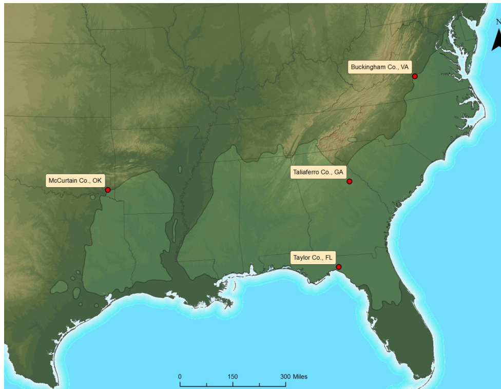
Figure 1. Map of the four throughfall reduction x fertilization study sites across the natural range of loblolly pine.

stands had been planted with a seed orchard mix of half-sib families representing local, genetically adapted sources.